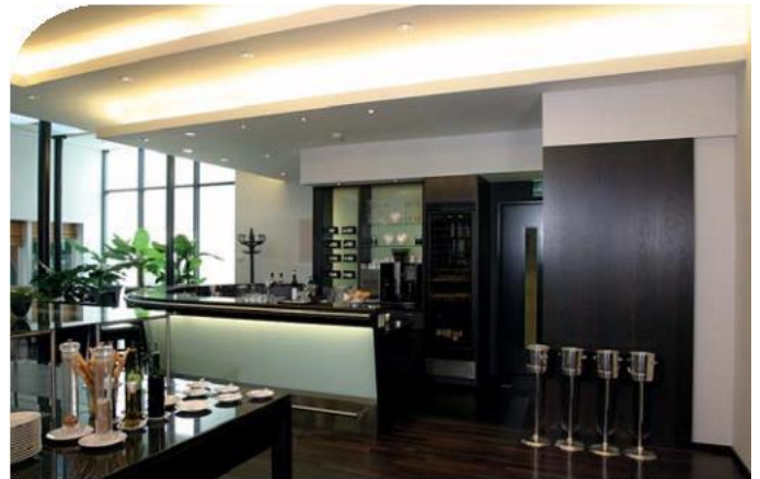
TopSolid'Wood meets the needs of designers, manufacturers and sub-contractors in the wood working sector.