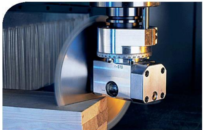
A powerful CAD/CAM solution for wood processing.

The TopSolid'Planner is fully integrated with the TopSolid, first by building the library in the design office using TopSolid'Wood, and, subsequently, by using the configurator directly from the preparation to the production of projects designed with