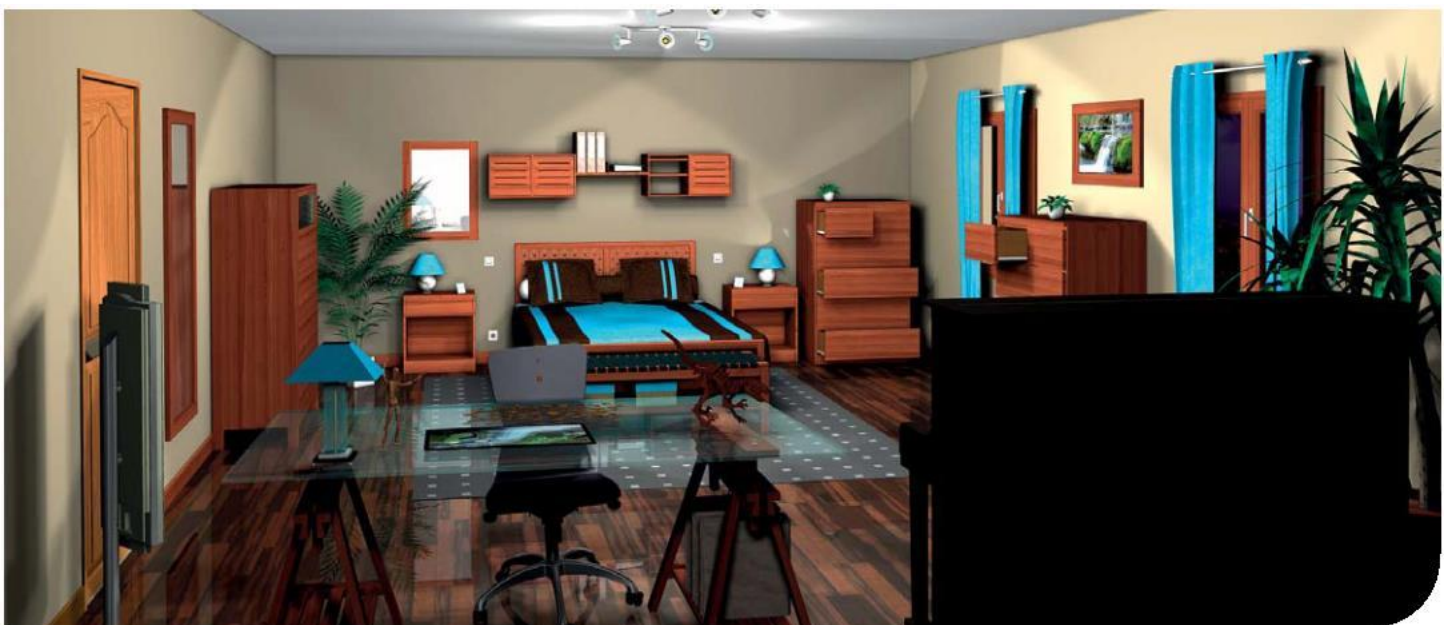
Interior design realized with TopSolid'Wood.