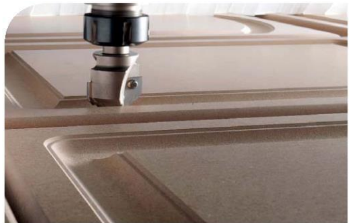
Designs made to be manufactured - TopSolid'Wood has been developed for use in a manufacturing environment and is completely integrated with TopSolid'WoodCam.

Nesting: This other key function is used to directly machine plates of nested parts from a multitude of projects. TopSolid'WoodCam calculates optimal nesting, in rectangles or any other shapes. This function makes significant savings in terms of materials and cycle times. Every part is tracked using labels.